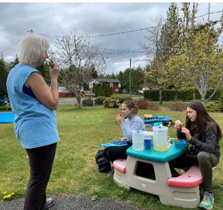
Yardwork can be fun!