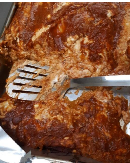
Grade 7-9 Food Studies Class made delicious lasagna today!