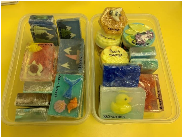
Looking for a Mother's Day gift? Sean's Crabby Soap in assorted, tantalizing aromas! $7 each Available at Avalon - drop in and see our selection!

Avalon Library: Watch for Pick up Times via Email/Facebook posts!