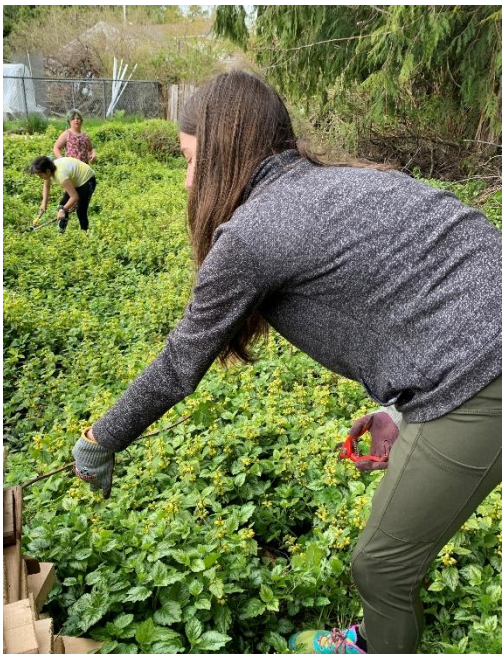
Well done, students! You worked hard!