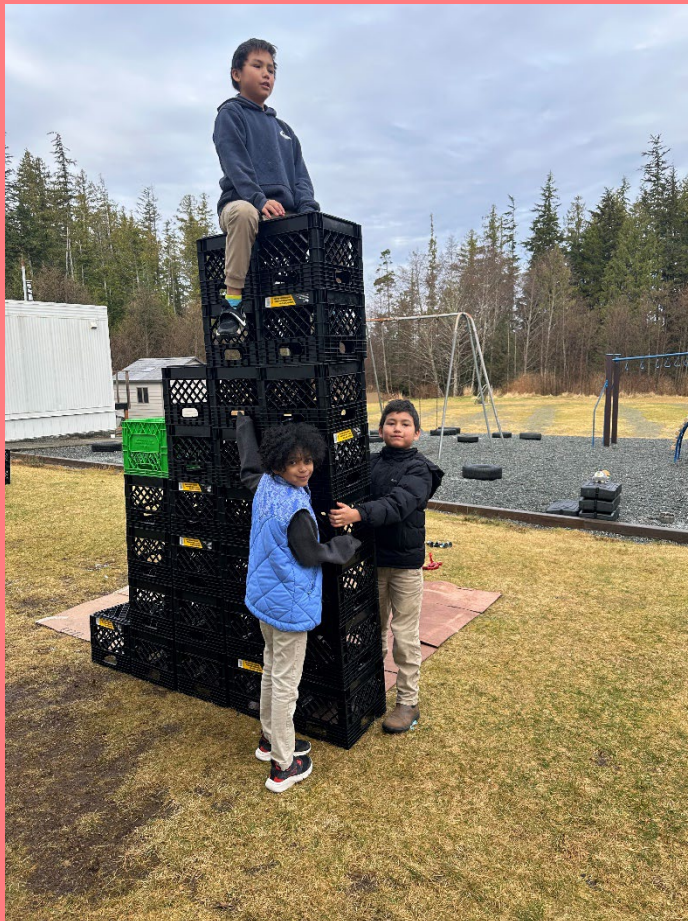
Milk crates for building blocks, added to our playground for creative play